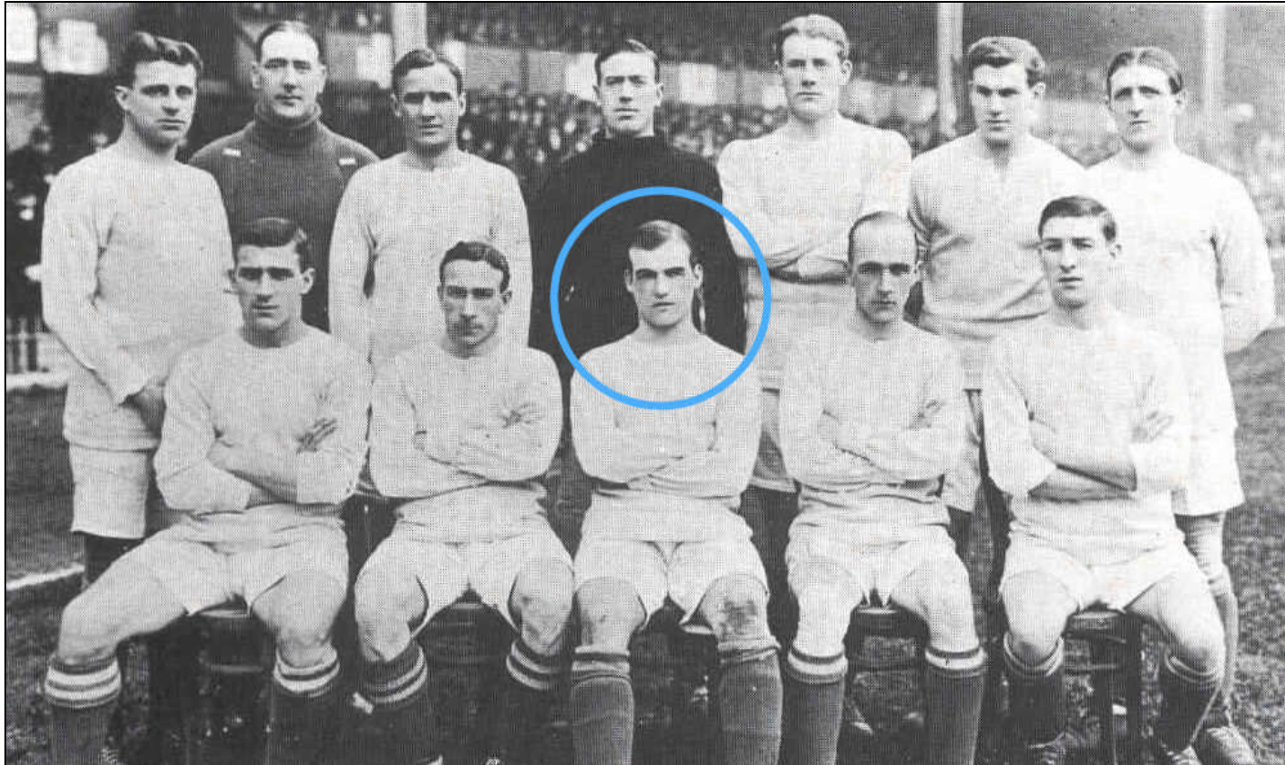
Chelsea F.A. Cup Final 1915