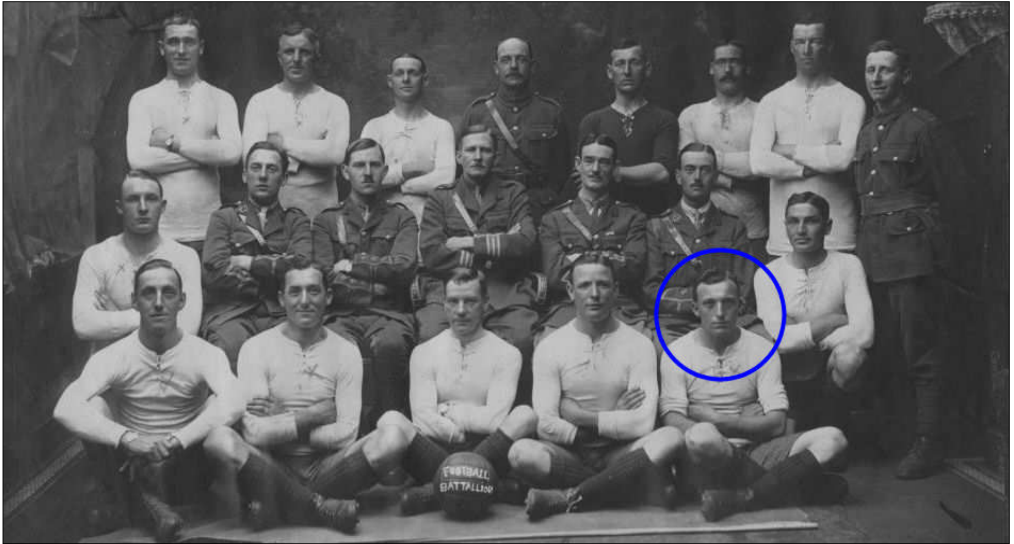
Footballers' Battalion 1917