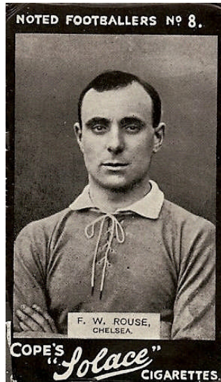
Copes Solace 1910