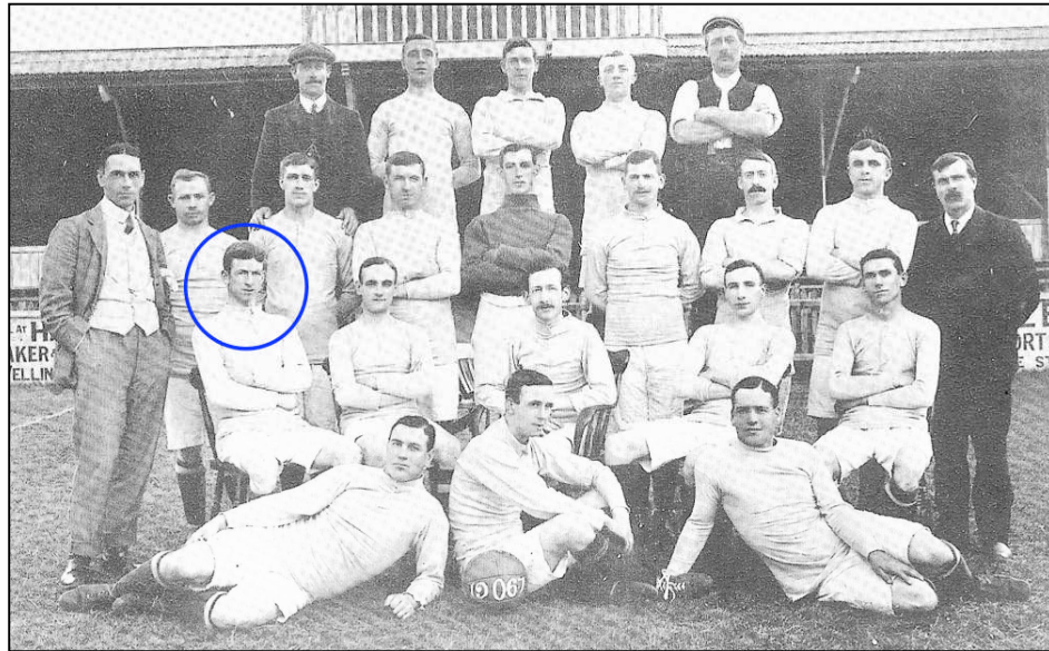
Luton Town 1906-07