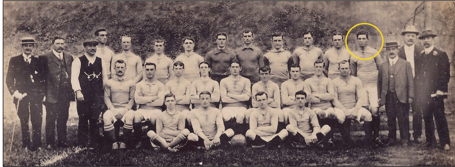
Norwich City 1910-11