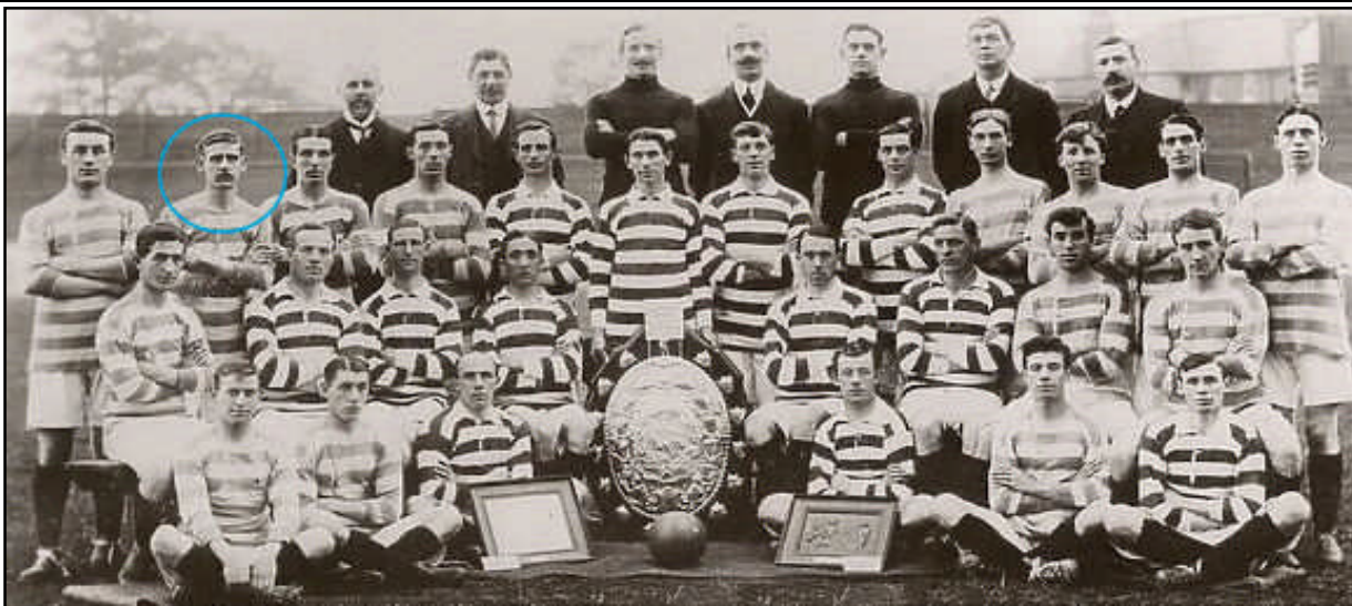
Queens Park Rangers 1912-13