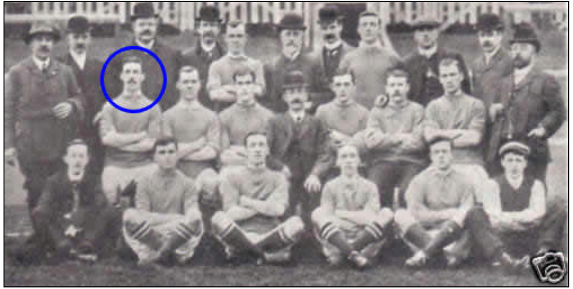
Oldham Athletic 1907-08