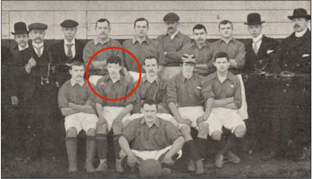
Crewe Alexandra 1901-02