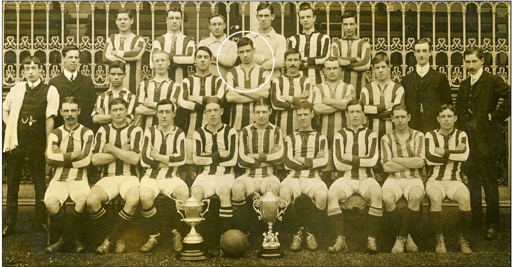
Swindon Victoria 1911-12