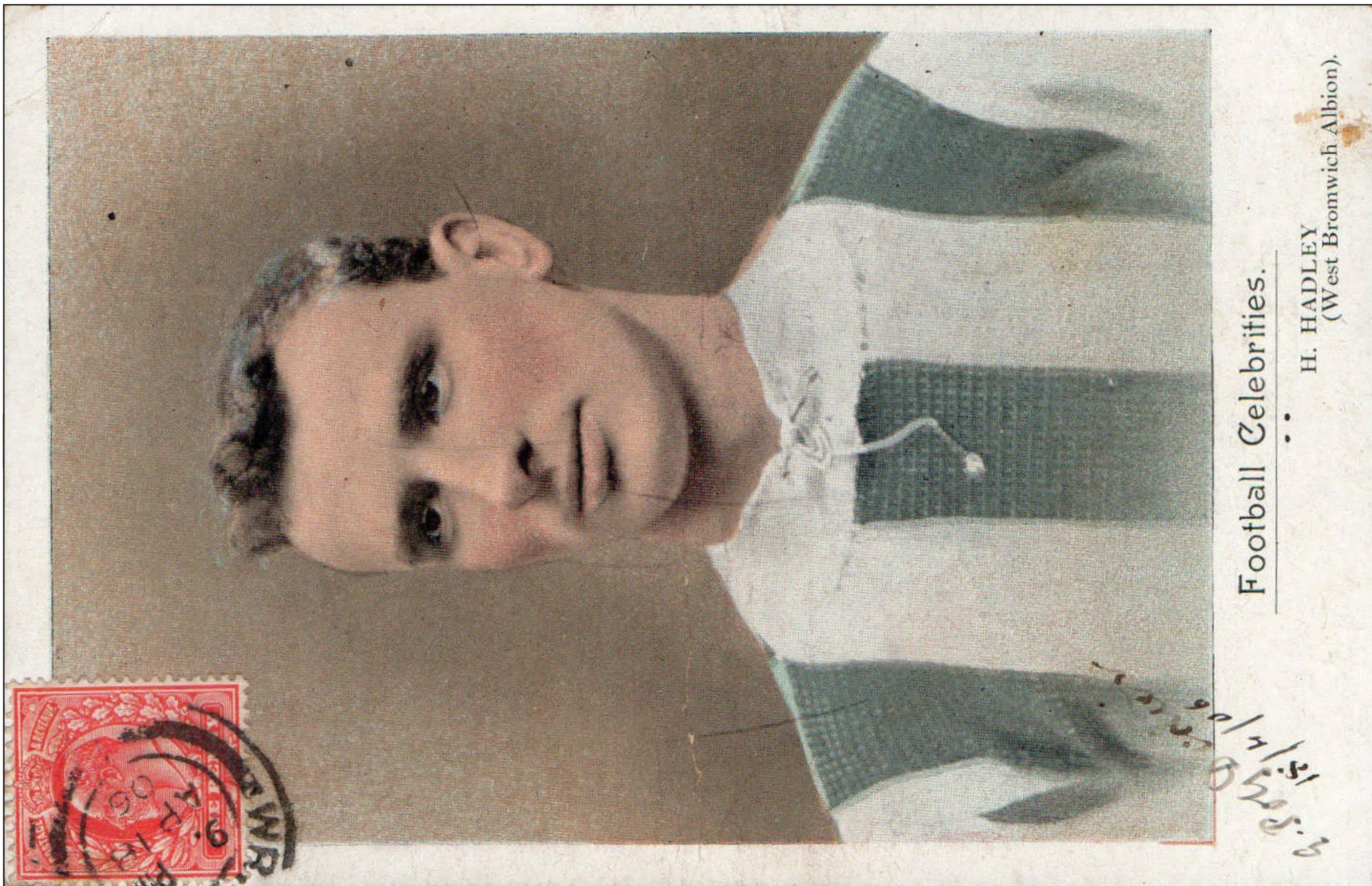
A postcard issued by the Birmingham Novelty Company in 1905