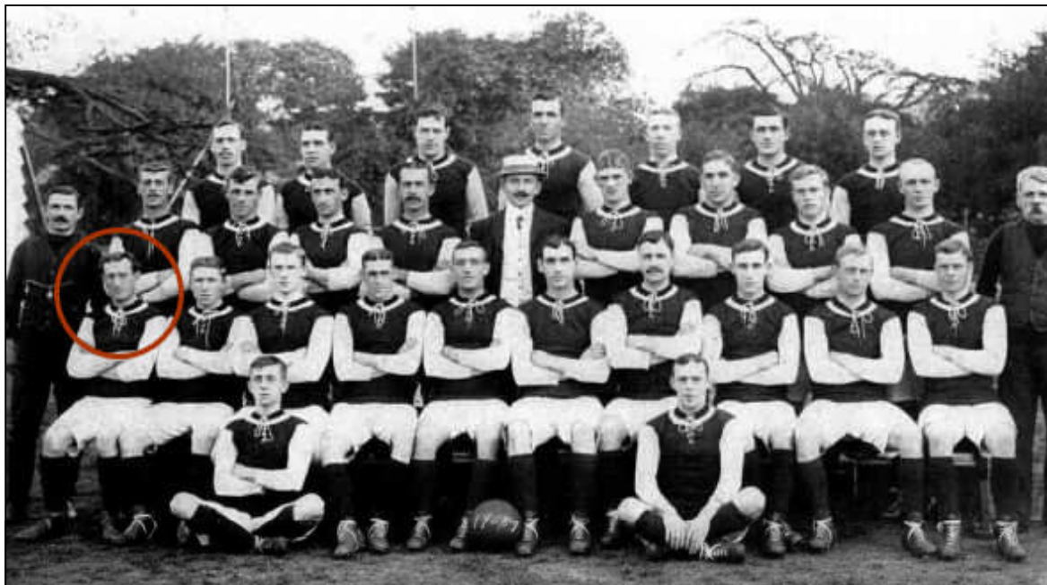
West Ham United 1908-09