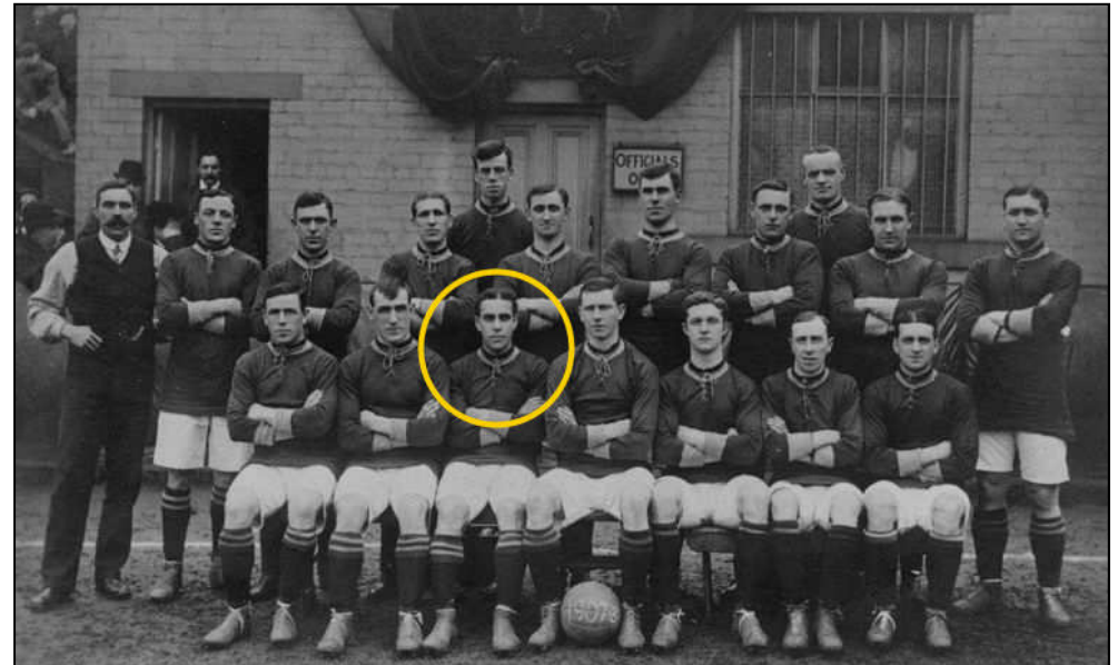
Bradford City 1907-08