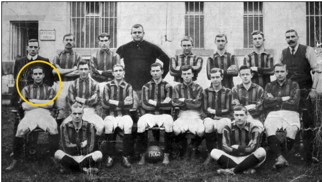
Bradford City 1906-07