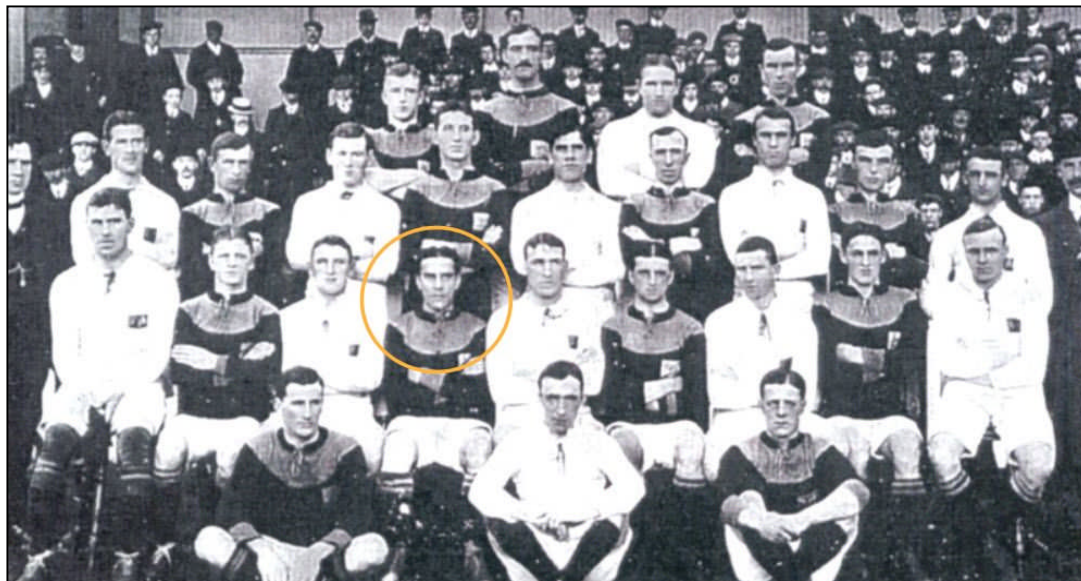
Bradford City 1909-10